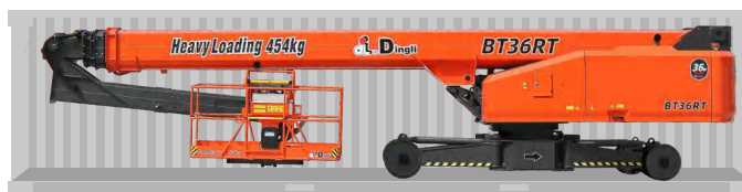
Standard Container Transport